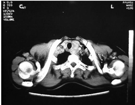
Figure 1. A hypodens mass located on left lobe of thyroid is seen on neck CT

Microscopically the excised thyroid specimen showed caseating epitheloid cell granuloma (Figure 2). PCR, an evaluation of the tissue, was applied to the fresh tissues and found to be positive for mycobacterium tuberculosis. Antituberculosis therapy was administered as Rifampin 600 mg, Isoniazid 300 mg, Pyrazinamid 3000 mg and Ethambutol 1250 mg. After antituberculosis chemotherapy was applied to the patient for ten months, she recovered from hoarseness. Hoarseness and fever disappeared on the first month of the postoperative examination.