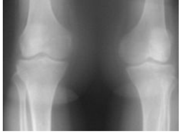
Figure 2. Radiologic view of the knees in anteroposterior position